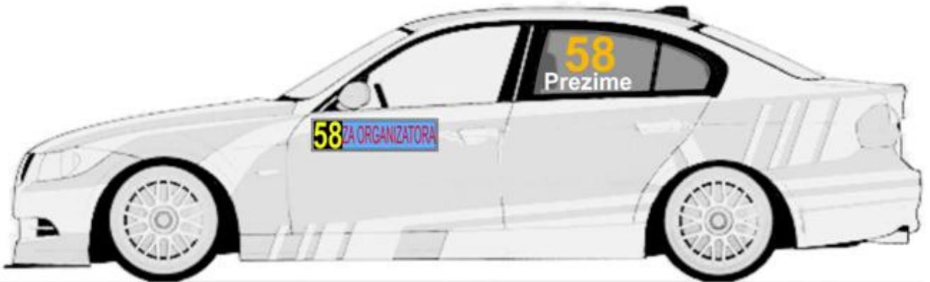
Zadnjim levim i desnim bočnim staklima, broj je visine 20cm sa debljinom linije od 2.5cm, font je Arial BOLD

Boja ovih brojeva je florescentno narandžasta i to PMS 804